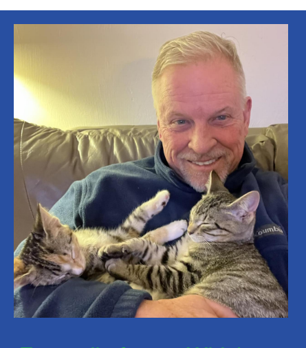
From all of us at Whiskers.