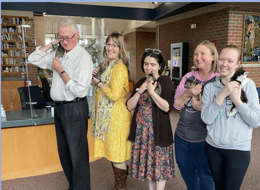
Library staff soak up kitten snuggles and