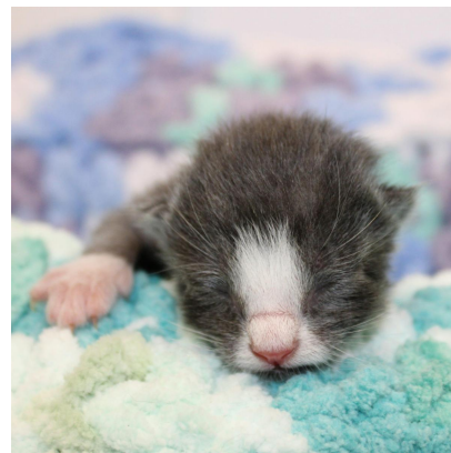
Victor (above) and Bubbles (below) are just two of many Whiskers TNR kittens enjoying blankets from Comfort for Critters!

Are you a knitter? Interested in helping Comfort for Critters in other ways or just learning more? Be sure to check out their website or Facebook page .